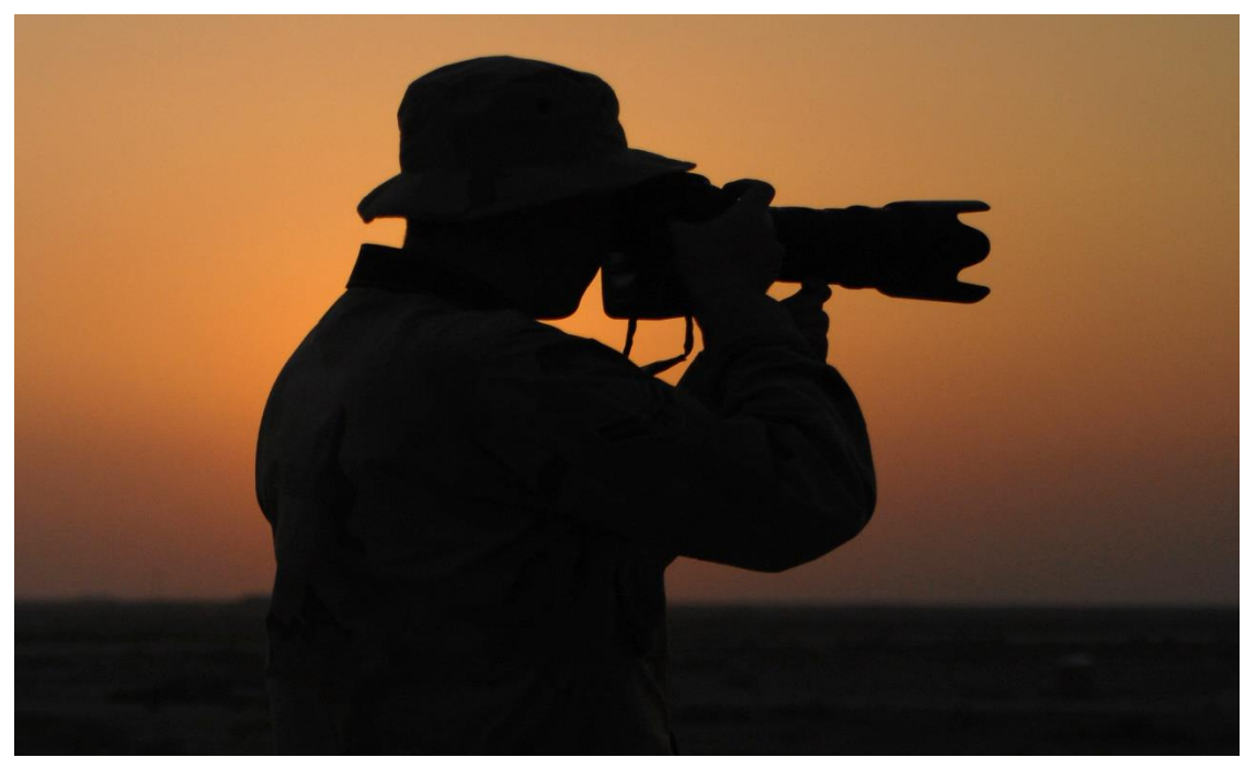
This Photo by Unknown Author is licensed under <u>CC BY-SA</u>